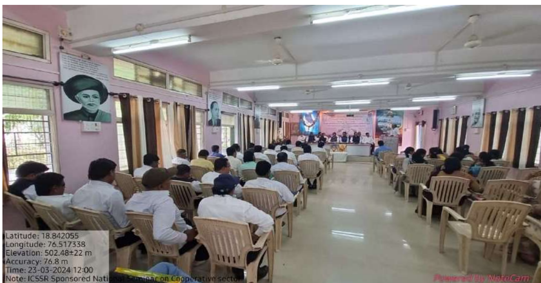
Dignitaries on the dais and present participants of the seminar.