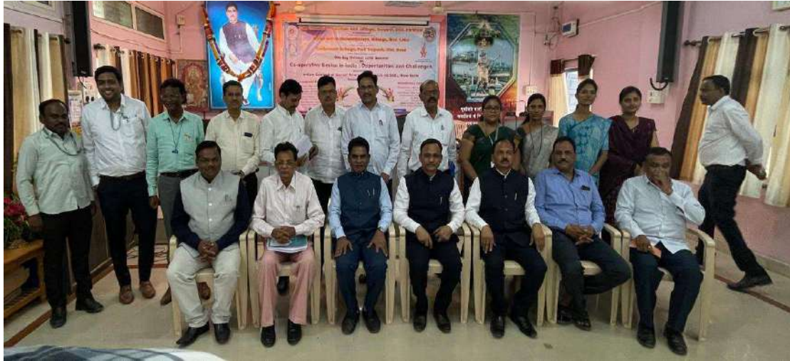
A Group photo of all respected dignitaries and some participants.